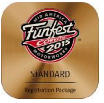
Route 66/St. Louis Corvette Club Autocross

Funfest is on September 17-20, 2015. If there are enough going we can do club parking. More at the next meeting.