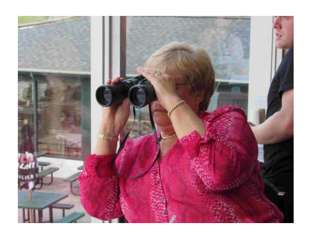
Hey guys, you should see what this couple is doing in their car!