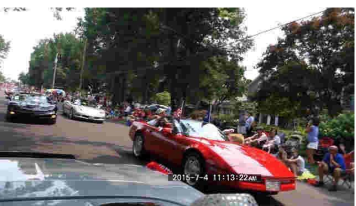
Tail of the Dragon