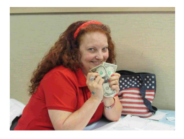
This picture has been sent to the IRS