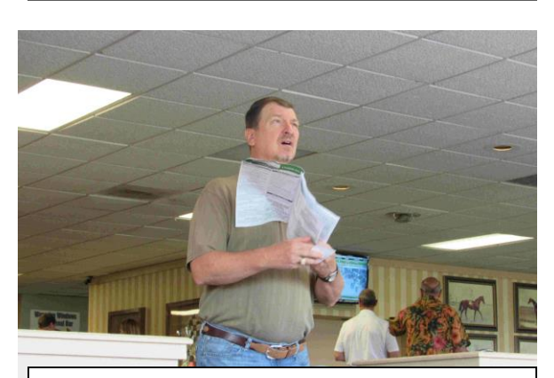
The look you get when your horse falls asleep at the starting line!