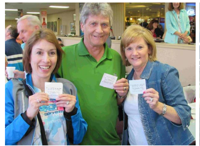
We all got our AARP cards!