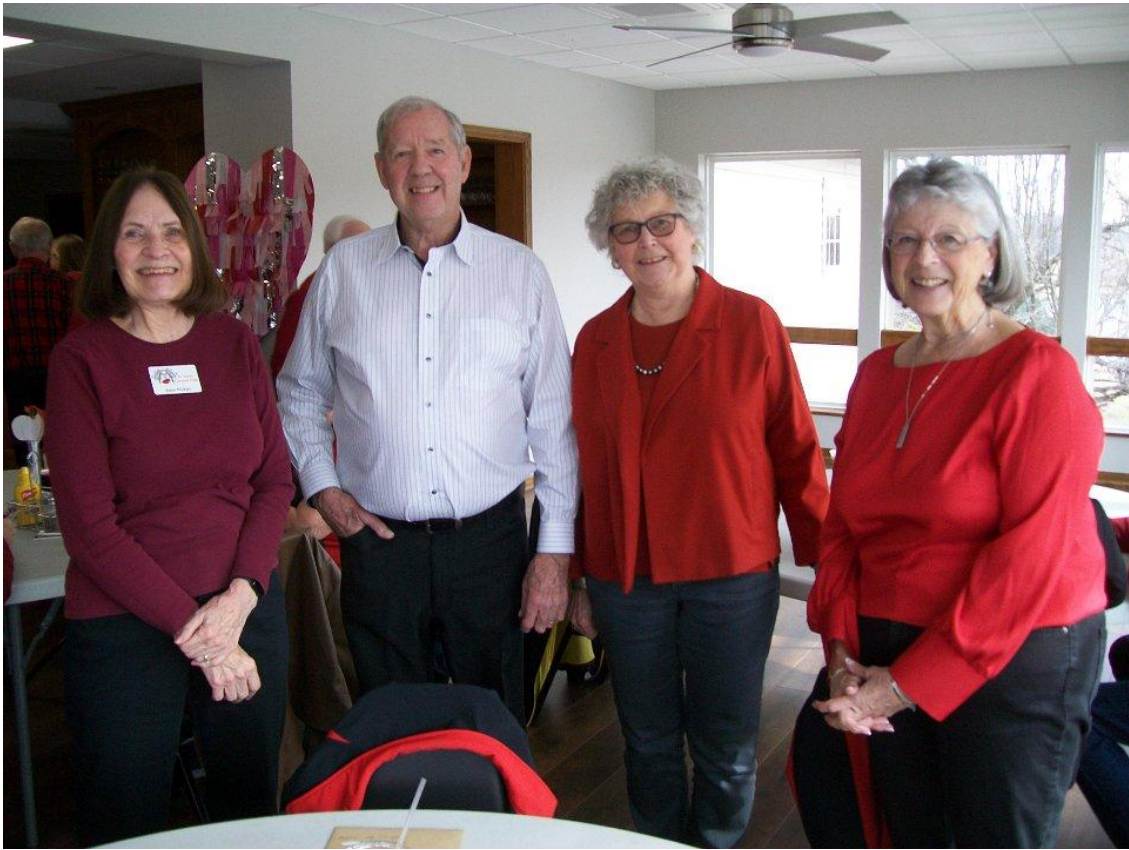
From our Valentine's Day Brunch in 2024, three lovely ladies and one old guy.