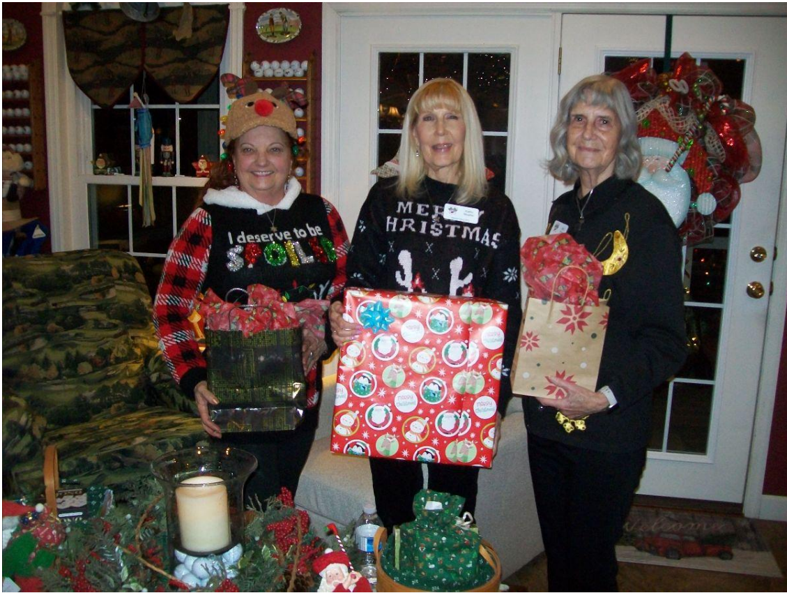
Ugly Sweater Contest Winners