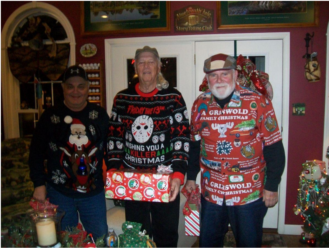
Ugly Sweater Contest Winners