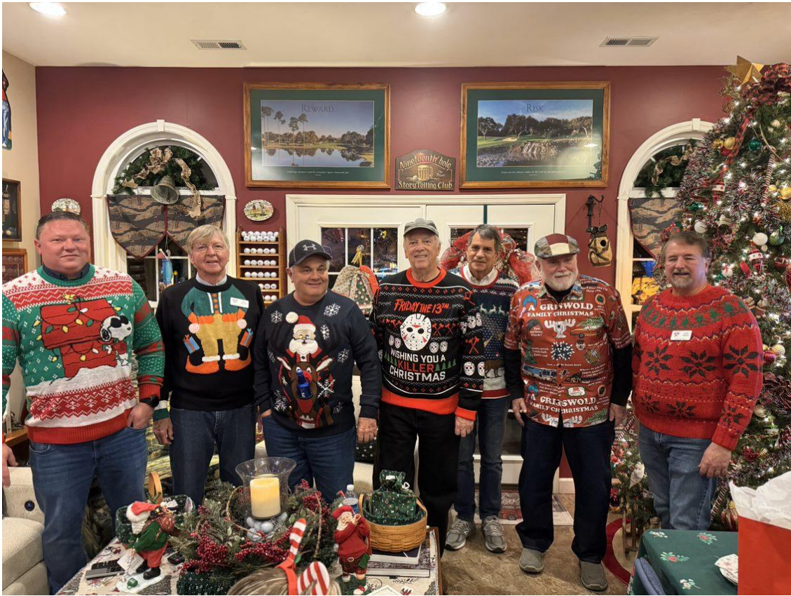
Ugly Sweater Contest participants.