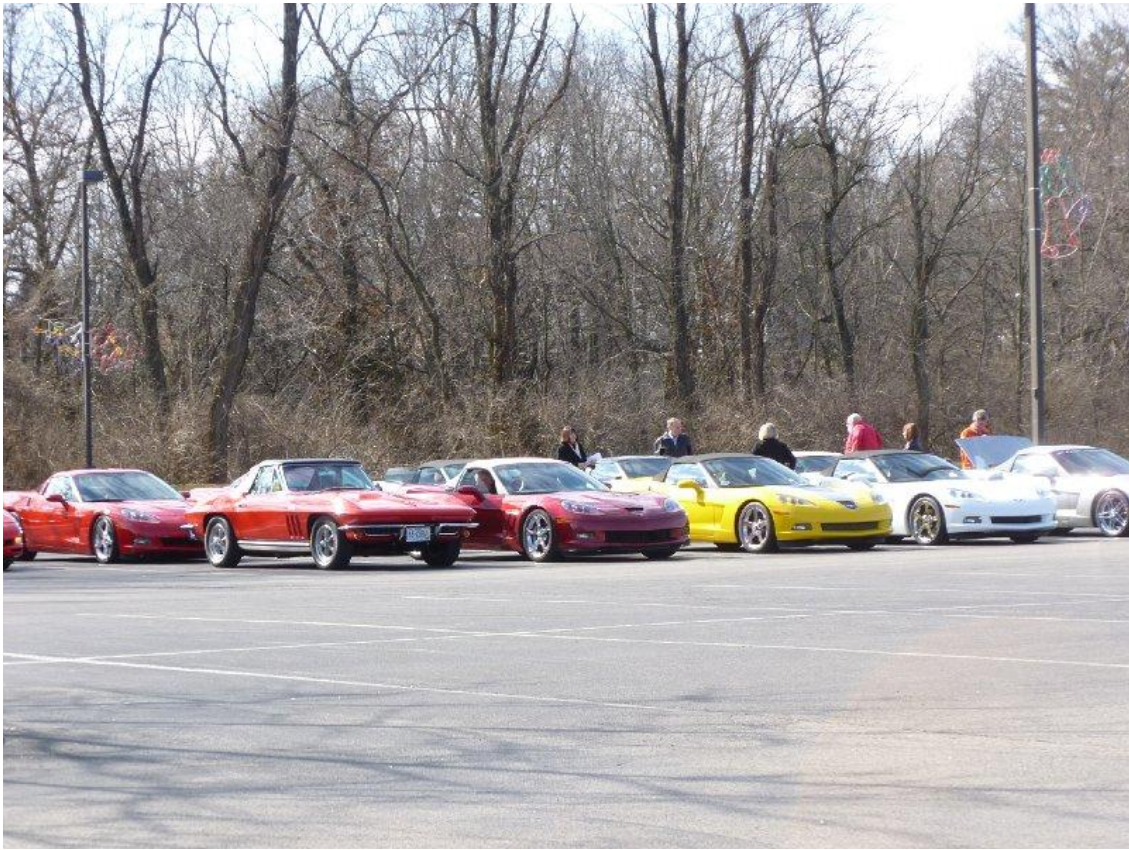
Everybody getting ready for our Valentine's Day Brunch at Scott AFB in 2013.