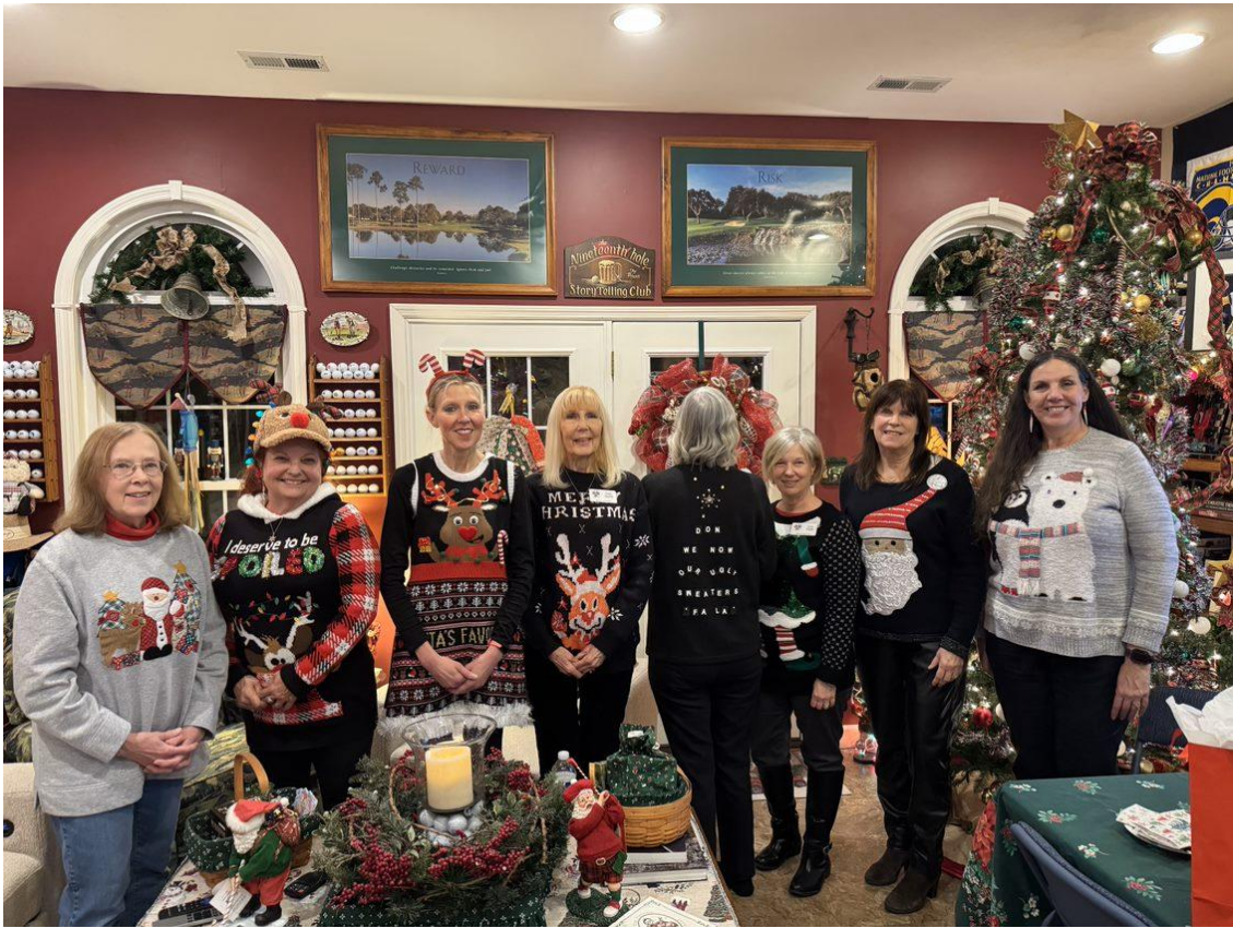
Ugly Sweater Contest participants.