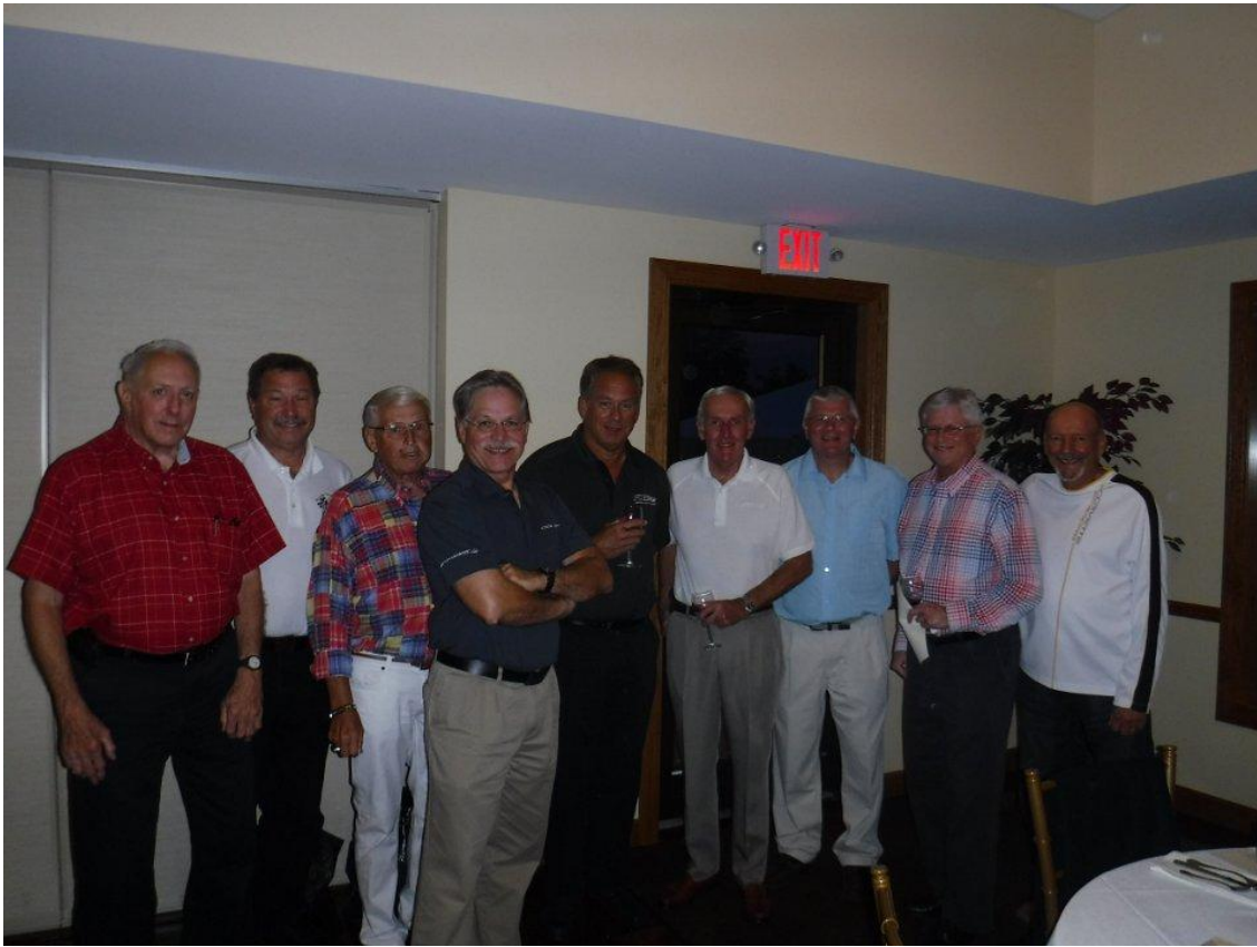
Some of the gentlemen at the Villa Antonio Winery dinner in 2016.