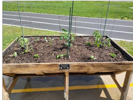
A vegetable garden was added this year.