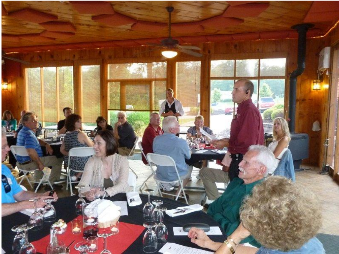
Members enjoying fine wine and food at Villa Antonio Winery from May 2014.