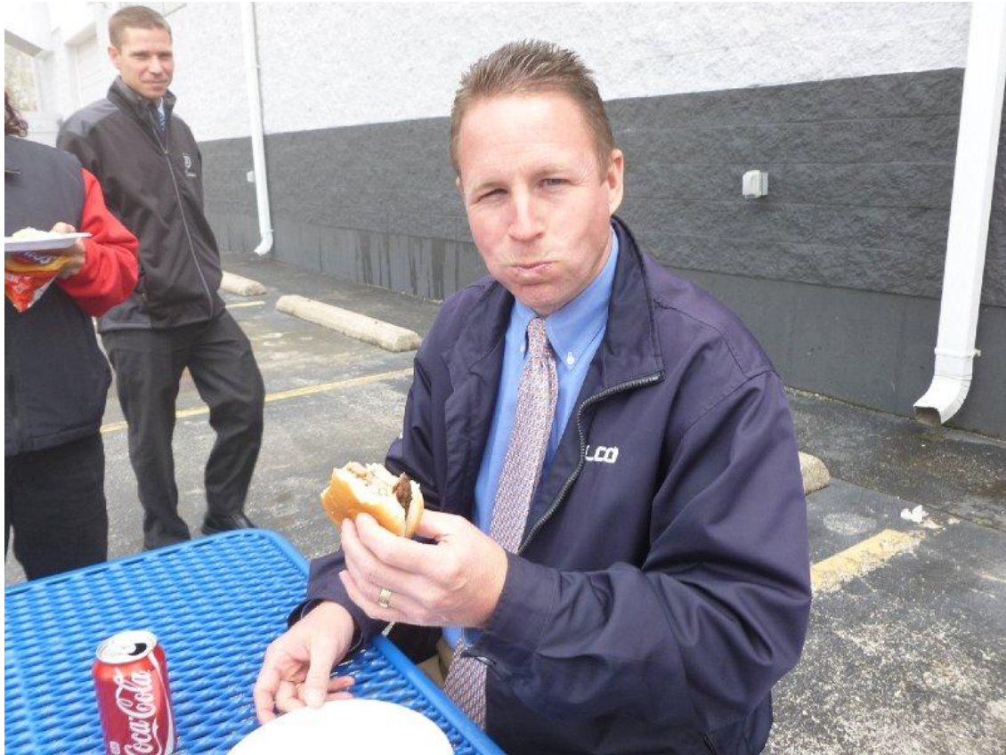
And why does this guy always seem to be eating? This is from our car show in May 2013.