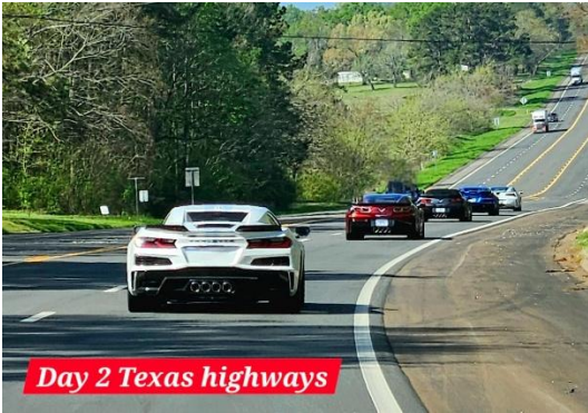
Day 2 Texas highways