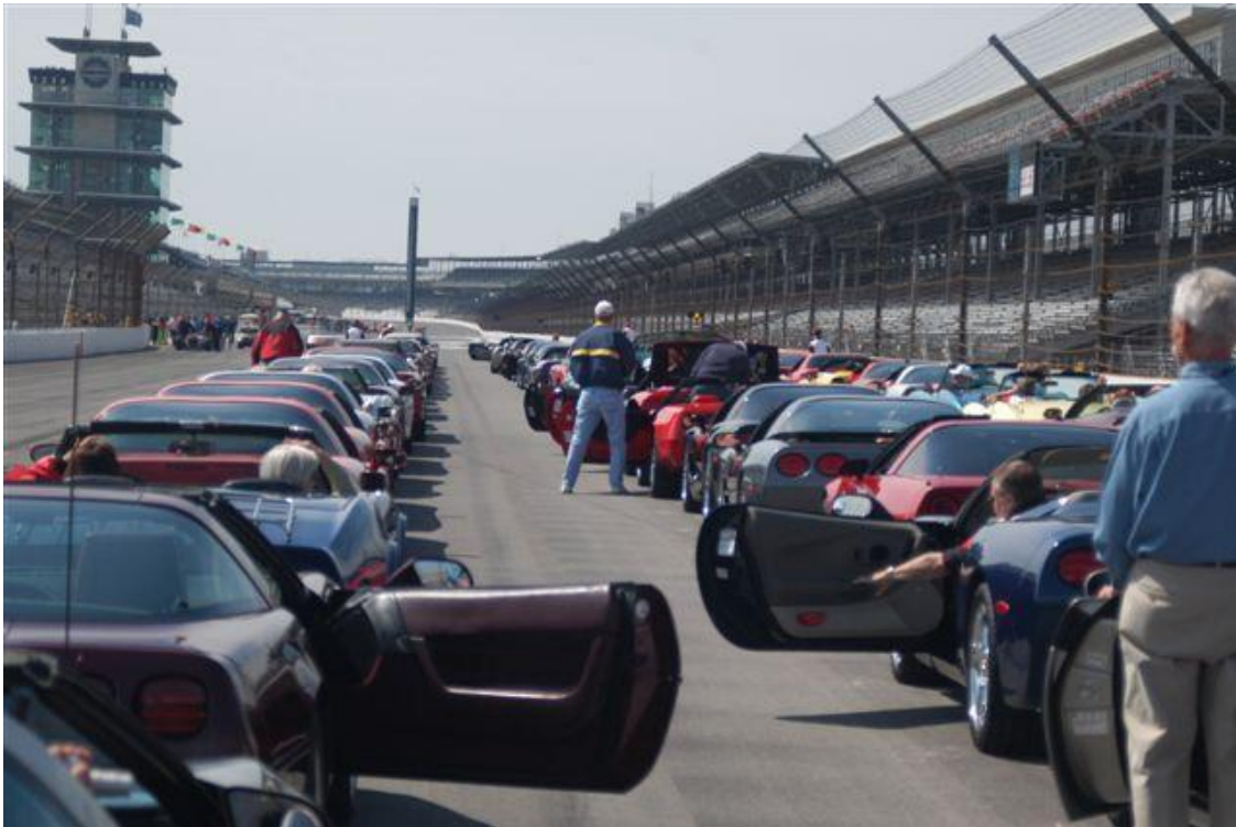
All lined up waiting to start our parade lap for the Indy 500 opening day ceremony from May 2006.