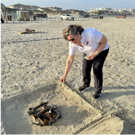
Our shrimp boil crew and a sunset.