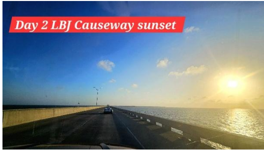
Day 2 LBJ Causeway sunset