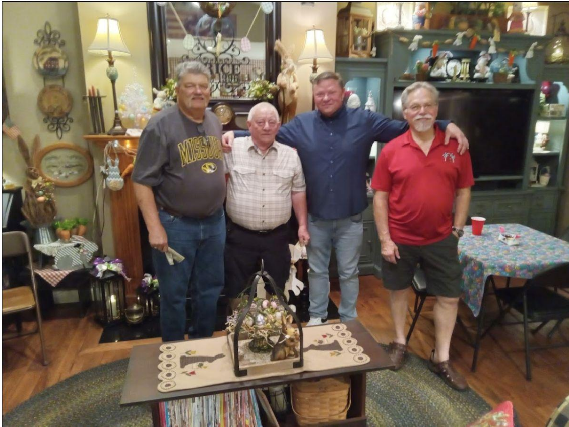
There were four Steves there, which kept things... interesting.